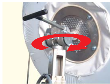
Adjust Handle sets any position of balloon.