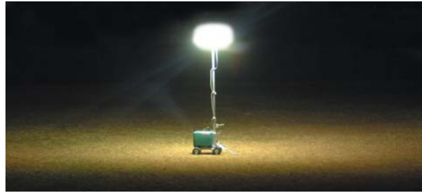
Large and 360 degrees area can be illuminated by homogeneous lighting.

Glare-Free Lighting. Safe for surrounding traffic.