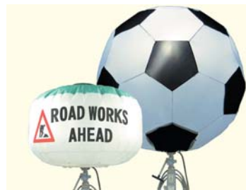
Decorated Balloon Replaceable with various balloons.