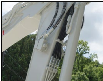
Up to 4 Service Ports (Optional)