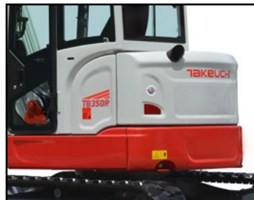
All Steel Construction